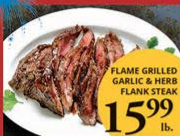
FLAME GRILLED GARLIC & HERB FLANK STEAK