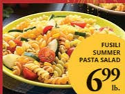
FUSILI SUMMER PASTA SALAD