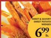
SWEET & SAVORY SWEET POTATO WEDGES