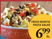
FRESH BOWTIE PASTA SALAD